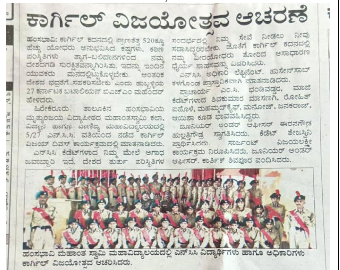
News Paper report: 28-07-2025.Samyukta Karnataka